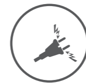
HIGH VOLTAGE SURGE PROTECTION

NOTE: *Power Factor may vary depending upon the Load. * Because of a policy of continuous product improvement, specifications are subject to change without notice.