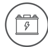
COMPATIBLE WITH ALL BATTERY TYPES TUBULAR, LOCAL & PLATE